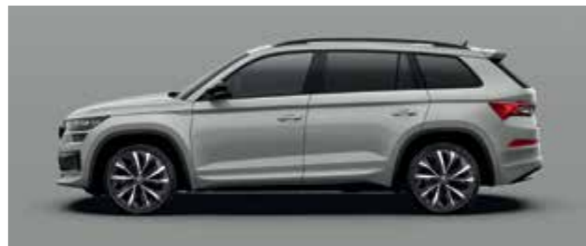
STEEL GREY METALLIC