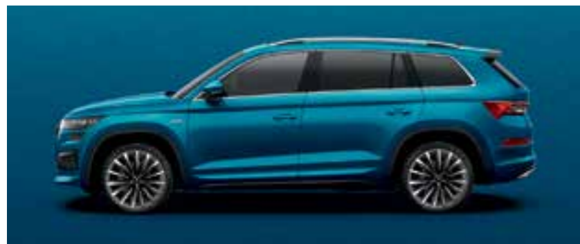
LAVA BLUE METALLIC